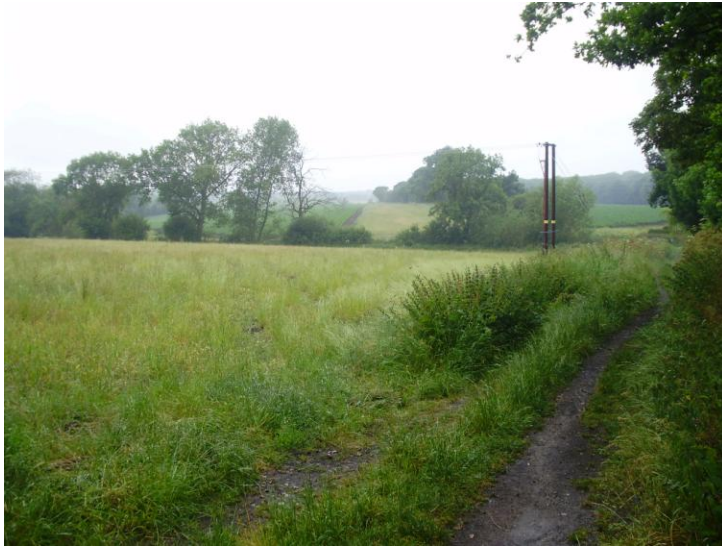
Existing site frontage