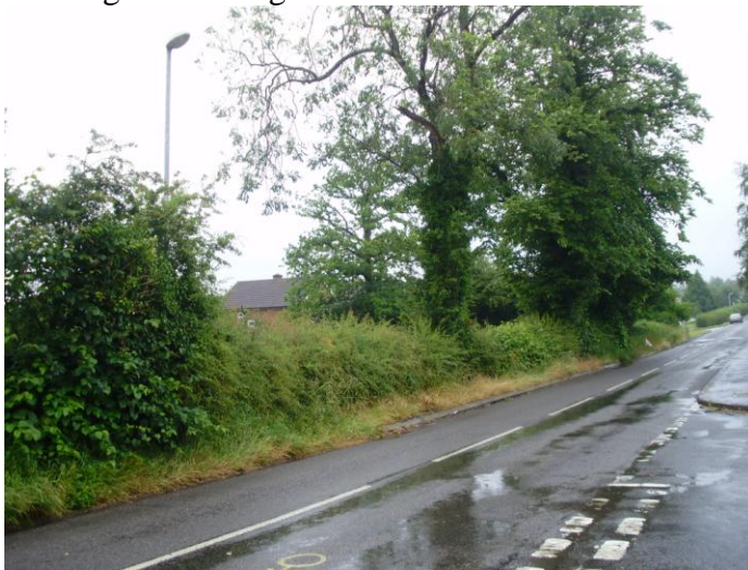
Willesley Lane viewed eastwards